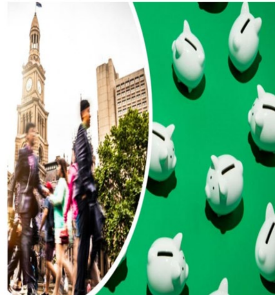
Australians caught up in global tax sting.

Hundreds of Australians have been caught up in a global tax sting targeting money laundering and tax evasion.